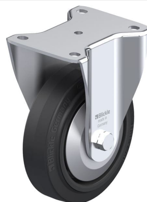
Corresponding rigid caster BH-POEV 160KAD-FA