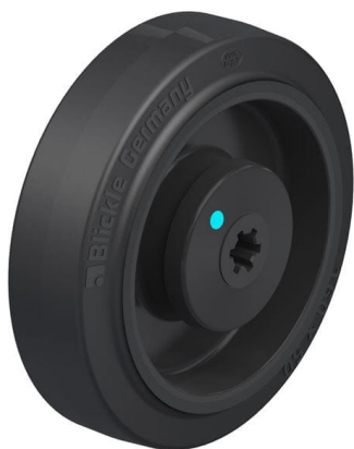
Wheel used POEV 160/12KAD