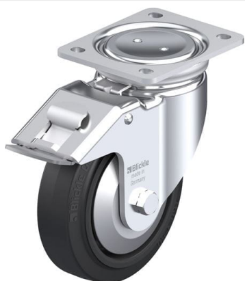
Corresponding standard locking LUH-POEV 160KAD-FI-FA