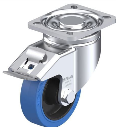
Corresponding standard locking LH-POEV 100XR-1-FI-SB