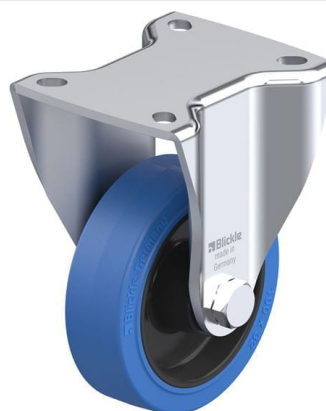
Corresponding rigid caster BH-POEV 100XR-1-SB