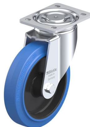
Corresponding swivel caster LH-POEV 200XR-SB