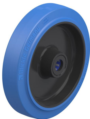
Wheel used POEV 200/20XR-SB