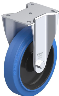
Corresponding rigid caster BH-POEV 200XR-SB