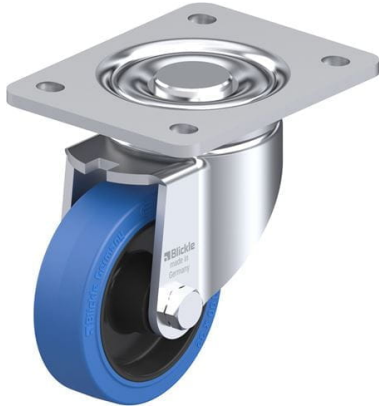
Corresponding swivel caster LH-POEV 100XR-3-SB