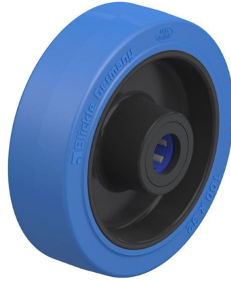
Wheel used POEV 100/15XR-SB