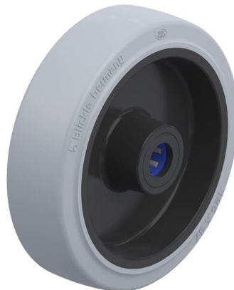
Wheel used POEV 125/15XR-SG