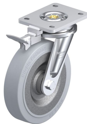
Corresponding swivel caster LO-SE 200K-SG-RI4