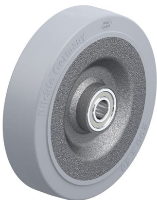
Wheel used SE 200/20K-SG