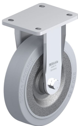
Corresponding rigid caster BO-SE 200K-SG