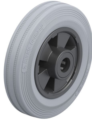
Wheel used VPP 160/20R-SG