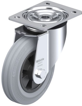
Corresponding swivel caster L-VPP 160R-SG