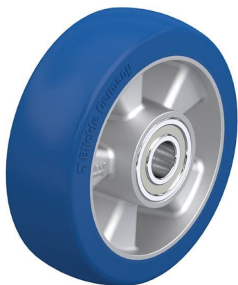
Wheel used ALBS 150/20K