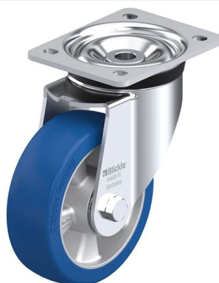
Corresponding swivel caster LK-ALBS 150K