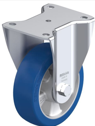
Corresponding rigid caster BH-ALBS 150K