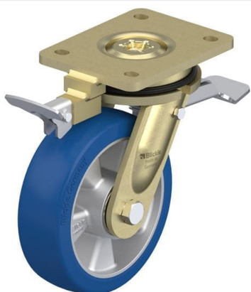
Corresponding standard locking LS-ALBS 160K-ST-RI4