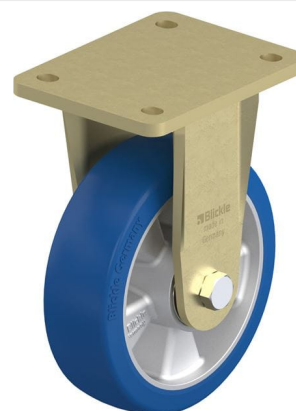
Corresponding rigid caster BS-ALBS 160K