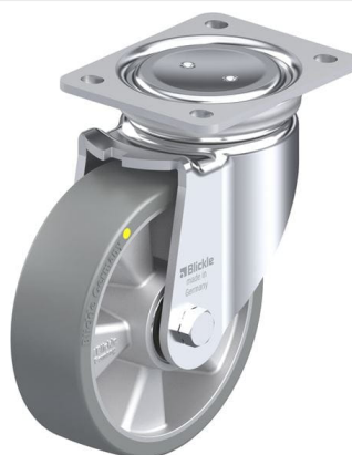
Corresponding swivel caster LUH-ALTH 160K-AS