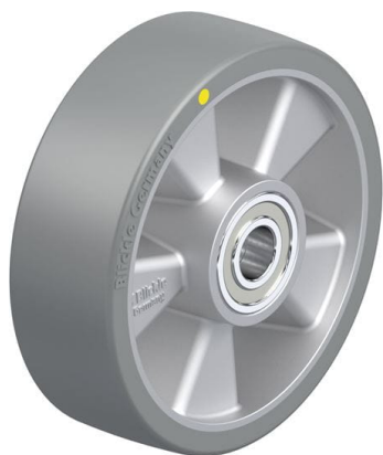
Wheel used ALTH 160/20K-AS