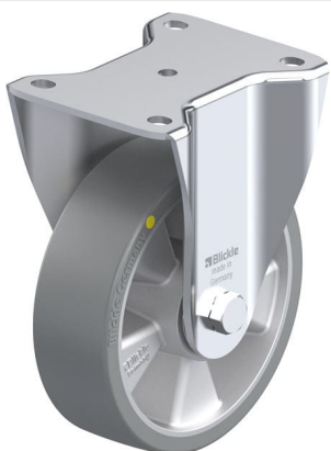
Corresponding rigid caster BH-ALTH 160K-AS