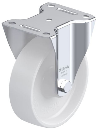
Corresponding rigid caster B-PO 160XR