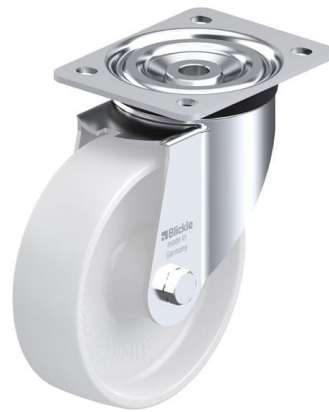
Corresponding swivel caster L-PO 160XR