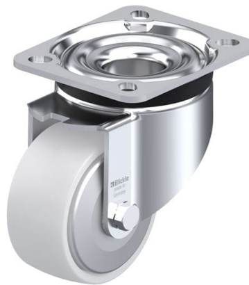
Corresponding swivel caster LK-PO 82R-FA