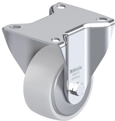
Corresponding rigid caster BK-PO 82R-FA