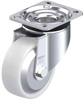
Corresponding swivel caster LK-PO 100XR-1-FA