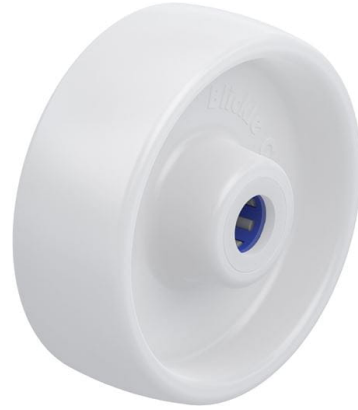
Wheel used PO 100/15XR