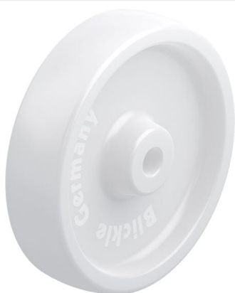
Wheel used SP0 201/20G