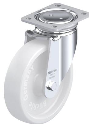
Corresponding swivel caster LUH-SP0 201G