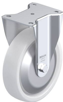
Corresponding rigid caster BH-SP0 201G-FA