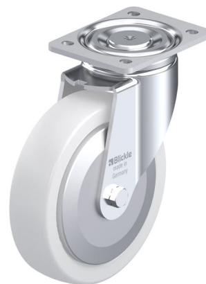
Corresponding swivel caster LH-SP0 200K-FA