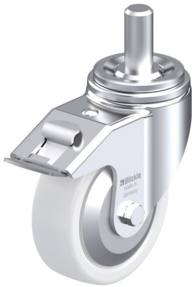
Corresponding standard locking LHZ-SPO 150K-FI-FA