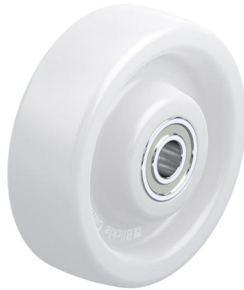
Wheel used SPO 150/20K