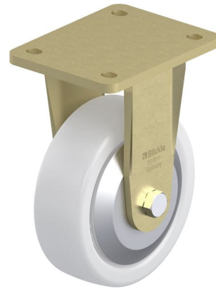
Corresponding rigid caster BS-SPO 150K-FA