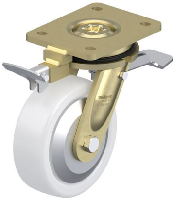
Corresponding standard locking LS-SPO 150K-ST-FA-RI4