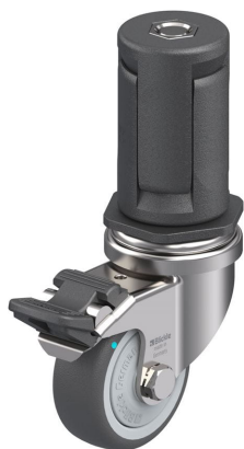
Corresponding standard locking LRXA-PATH 50KFD-FI-EXR05