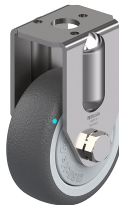
Corresponding rigid caster BRXA-PATH 50KFD