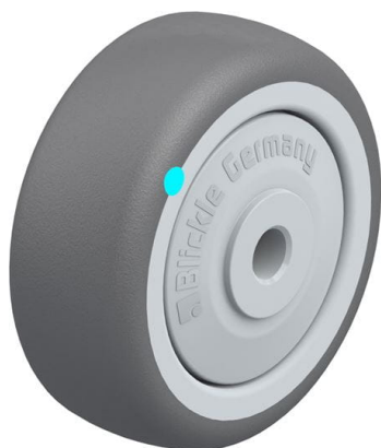
Wheel used PATH 50/6KFD