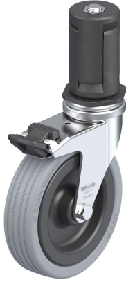
Corresponding standard locking LRA-VPA 100G-FI-ER05