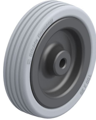
Wheel used VPA 100/8G