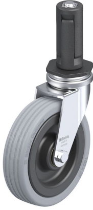
Corresponding swivel caster LRA-VPA 100K-ER03