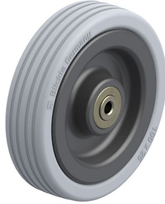
Wheel used VPA 100/6K