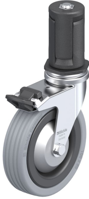
Corresponding standard locking LRA-VPA 100K-FI-FA-ER05