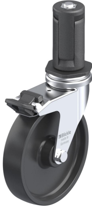
Corresponding standard locking LRA-POA 102G-FI-ER04