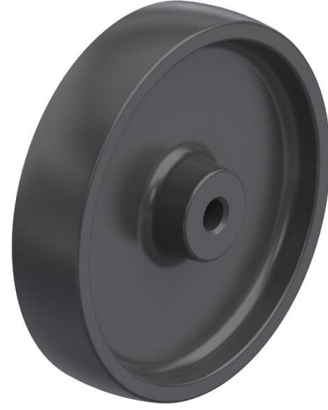
Wheel used POA 102/8G