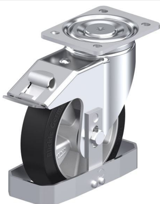
Corresponding standard locking LH-ALEV 180K-FI-FS