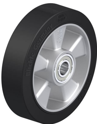
Wheel used ALEV 180/20K