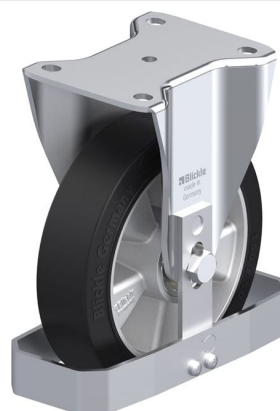
Corresponding rigid caster BH-ALEV 180K-FS