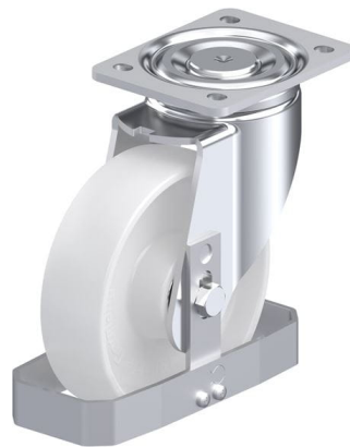
Corresponding swivel caster LH-PO 175K-FS