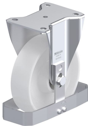
Corresponding rigid caster BH-PO 175K-FS