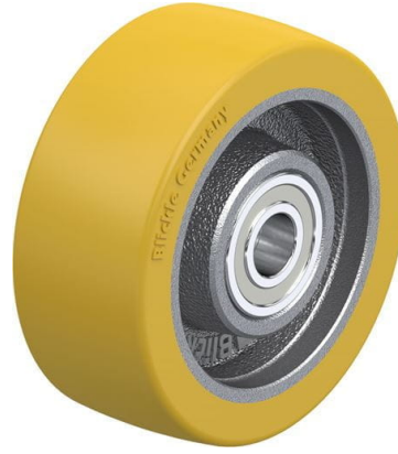
Wheel used GTH 100/15K