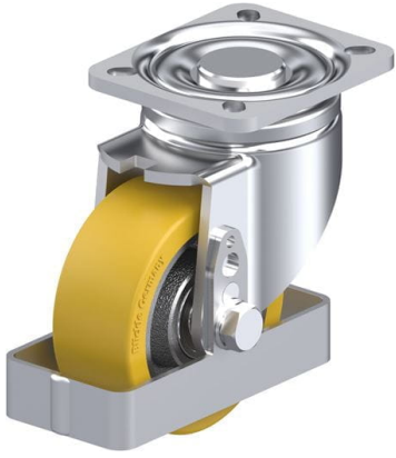
Corresponding swivel caster LH-GTH 100K-1-FS