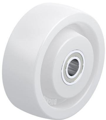
Wheel used SP0 100/15K