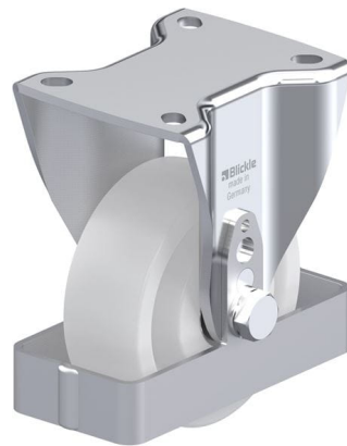
Corresponding rigid caster BH-SP0 100K-1-FS