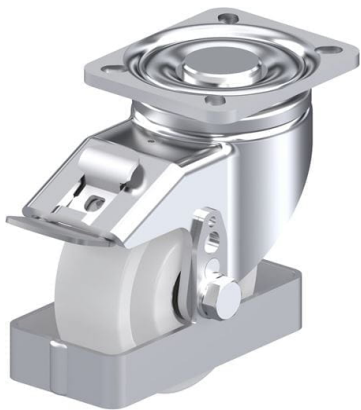
Corresponding standard locking LH-SP0 100K-1-FI-FS