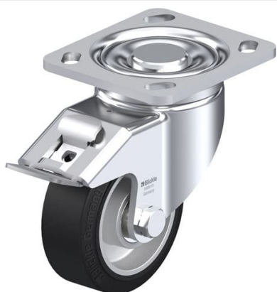
Corresponding standard locking LH-ALEV 100K-14-FI