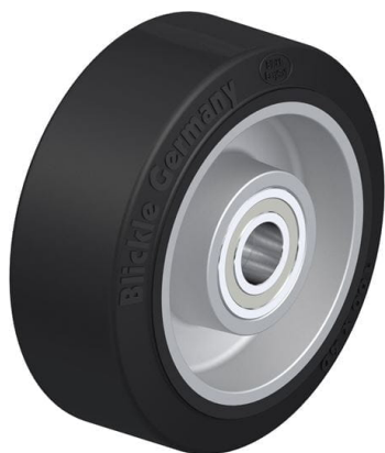
Wheel used ALEV 100/15K