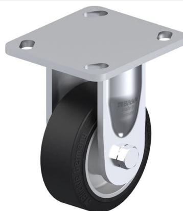
Corresponding rigid caster BHS-ALEV 100K-14