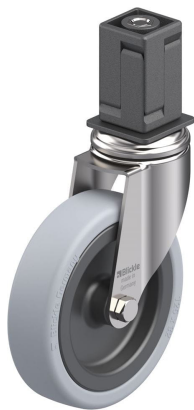
Corresponding swivel caster LKRXA-VPA 126G-11-EXV18