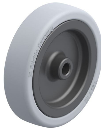
Wheel used VPA 126/12G