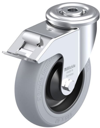
Corresponding standard locking LER-POES 125KA-FI-SG