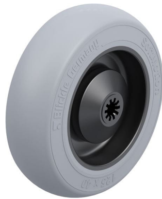
Wheel used POES 125/8KA-SG