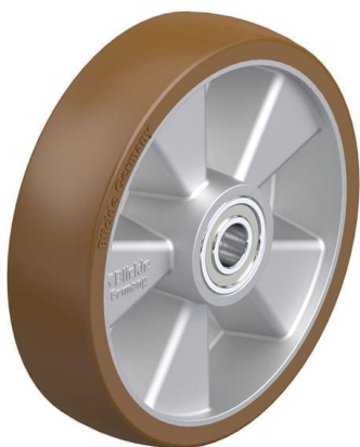
Wheel used ALB 200/20K