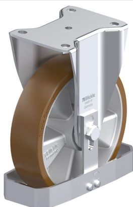
Corresponding rigid caster BH-ALB 200K-FS