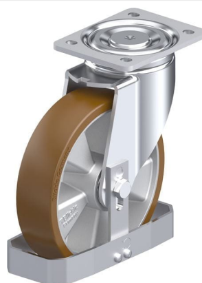
Corresponding swivel caster LH-ALB 200K-FS