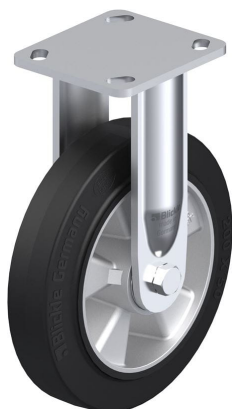
Corresponding rigid caster BEHS-ALEV 200K-14-01