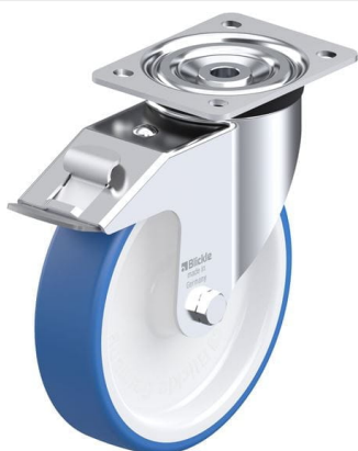
Corresponding standard locking L-POTHS 200G-FI