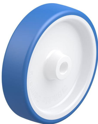
Wheel used POTHS 200/20G