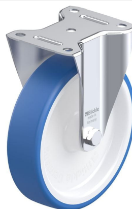
Corresponding rigid caster B-POTHS 200G