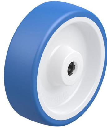
Wheel used POTHs 125/15R