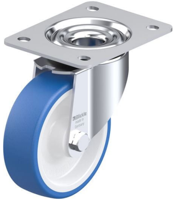
Corresponding swivel caster LK-POTHS 125R-3