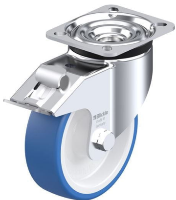
Corresponding standard locking LK-POTHS 125R-1-FI