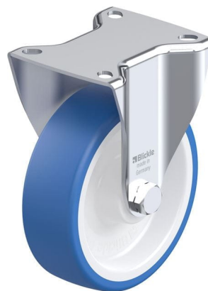
Corresponding rigid caster BK-POTHS 125R-1