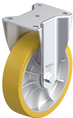
Corresponding rigid caster BH-ALTH 202K