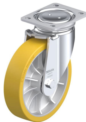
Corresponding swivel caster LUH-ALTH 202K