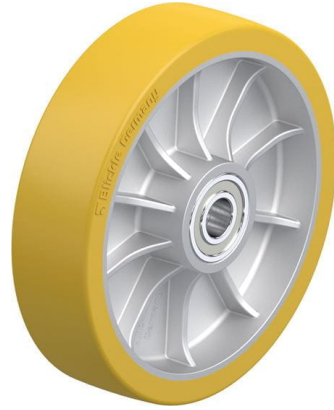
Wheel used ALTH 202/20K