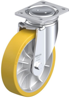
Corresponding swivel caster LUH-ALTH 202K