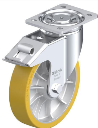
Corresponding standard locking LH-ALTH 202K-FI