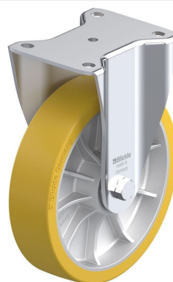
Corresponding rigid caster BH-ALTH 202K