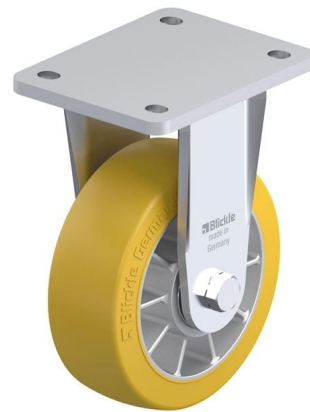
Corresponding rigid caster BO-ALTH 152K