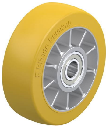
Wheel used ALTH 152/20K