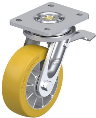
Corresponding standard locking LO-ALTH 152K-ST