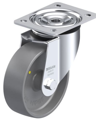
Corresponding swivel caster L-PO 150G-ELS