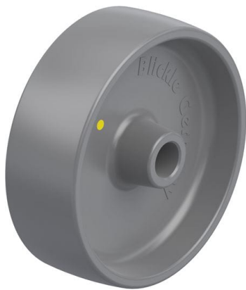
Wheel used PO 150/20G-ELS