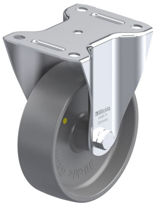
Corresponding rigid caster B-PO 150G-ELS