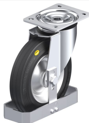
Corresponding swivel caster L-RD 202R-FS