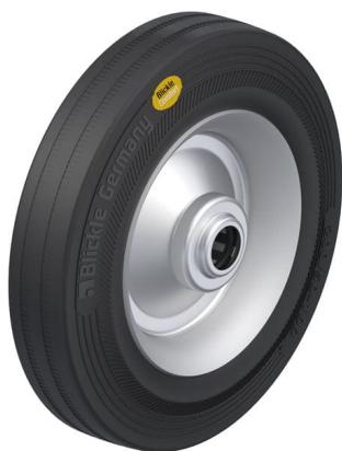
Wheel used RD 202/20R