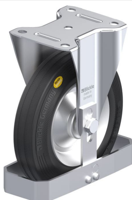
Corresponding rigid caster B-RD 202R-FS