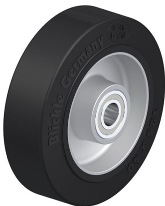
Wheel used ALEV 125/15K