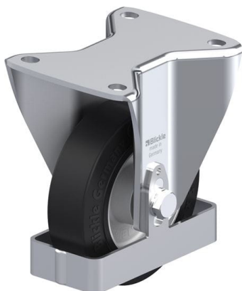
Corresponding rigid caster BH-ALEV 125K-3-FS