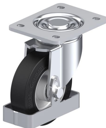
Corresponding swivel caster LH-ALEV 125K-3-FS