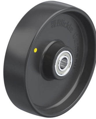
Wheel used PP 200/20K-EL