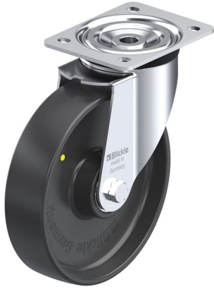
Corresponding swivel caster L-PP 200K-EL